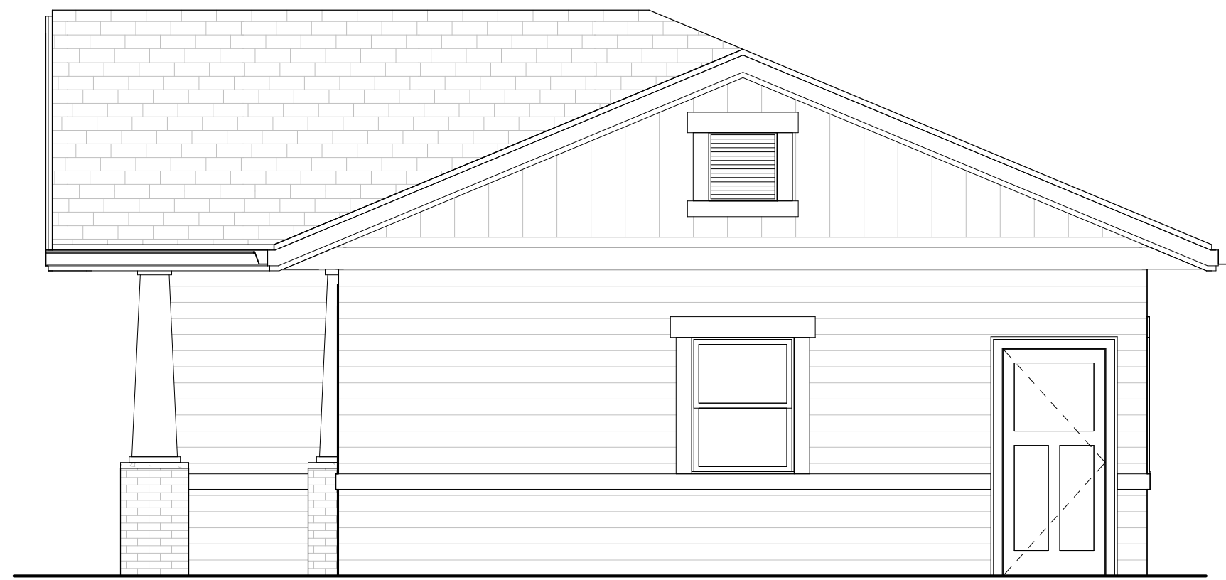
WEST ELEVATION 0' 2' 4' 8' 16'