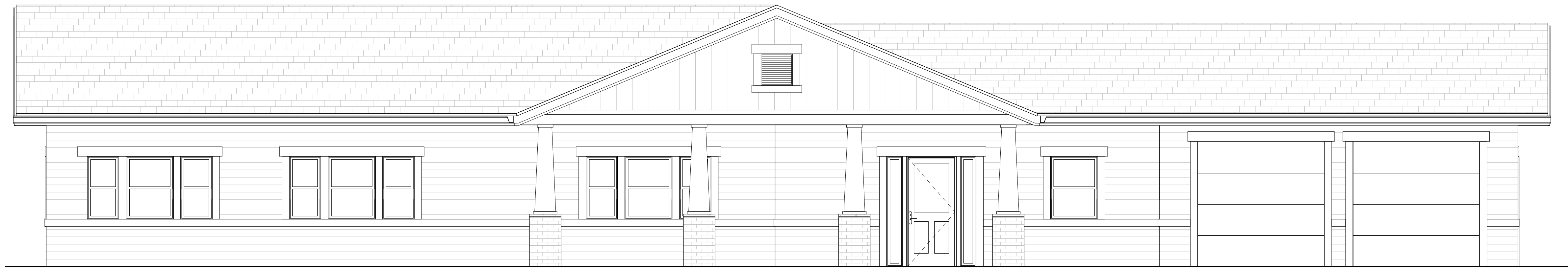
NORTH ELEVATION 0' 2' 4' 8' 16'